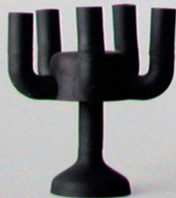
1 Black Gold Five-armed candleholder 2002 Erik Jan Kwakkel Black porcelain

As part of her 'modular porcelain' project, Ineke Hans produced only five shapes/moulds, and used them to make vases, coffee pots, candleholders and chandeliers in graphically striking black porcelain.